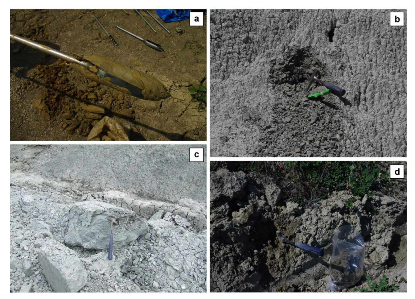
Fig. 3. Representative images showing the sampling of clay (a) via manual drilling, (b, c, d) directly on the outcrop.

During the project more than 370 ceramic and 35 clays samples from the major (Paestum, Pontecagnano, and Fratte) and minor sites in the territory (e.g., sacred areas as San Nicola di Albanella) have been investigated in order to identify local productions and connectivity<sup>16</sup>. These samples also included a few pottery samples constituting imports from Paestum to the neighbouring site of Velia. The selection of pottery was made taking into account the ceramic class and function of the pottery from the different contexts and periods. The analysed ceramic classes include common ware, fine pottery, building materials, instrumenta , and production indicators (i.e., kiln wastes, spacers, etc.).